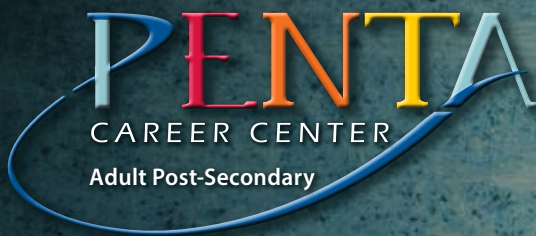
CHART YOUR COURSE

Hands-on training. Less than a year to complete!